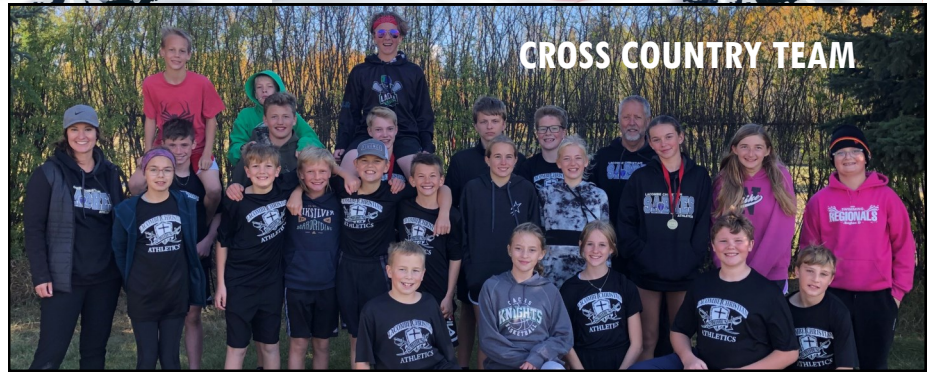
CROSS COUNTRY TEAM