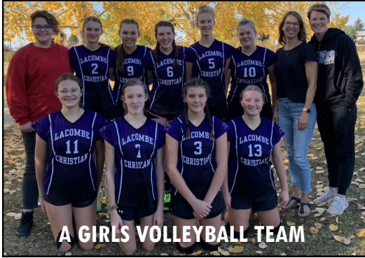
A GIRLS VOLLEYBALL TEAM