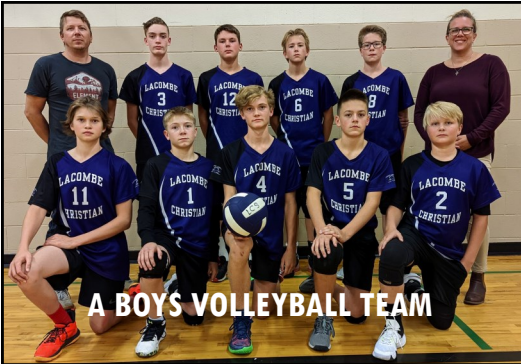
A BOYS VOLLEYBALL TEAM