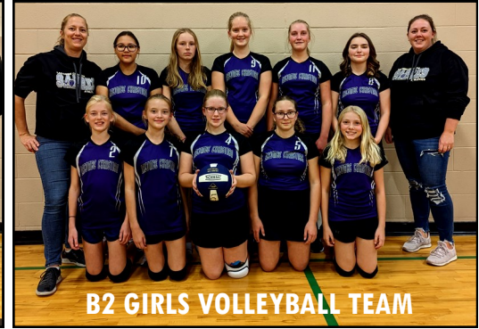
B2 GIRLS VOLLEYBALL TEAM