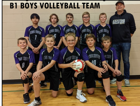
B1 BOYS VOLLEYBALL TEAM