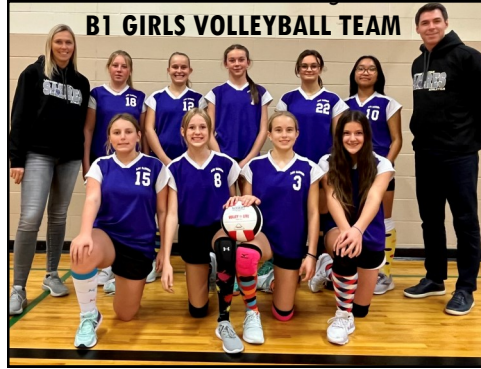
B1 GIRLS VOLLEYBALL TEAM