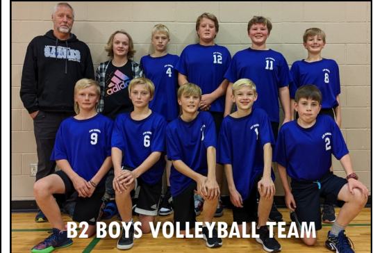
B2 BOYS VOLLEYBALL TEAM

The No.1 purpose for our students to be involved in extra-curricular activities is to allow for opportunities that encourage the use of their God-given talents & abilities outside the classroom, aiding in the development of several key areas: Character, Patience, Humility, Work Ethic, Teamwork, Christian Leadership, Competition, and Sportsmanship. Junior High students were happy to be involved in regular league play this season! The cross country team ran to the top of 2J Championships! The volleyball season is now complete, with both A Boys & Girls Teams winning the WC Championships and CWAJHAAs! Thank you Coaches, for your dedication and encouragement! K-9 Hockey is underway and the focus now turns to the Basketball season.