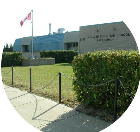
East Campus (P-2)